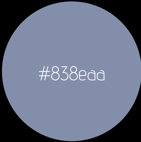
Cut from Marble