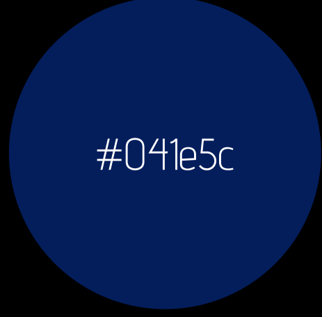
Building on Hope