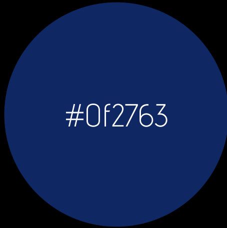
A Brighter Middlebury