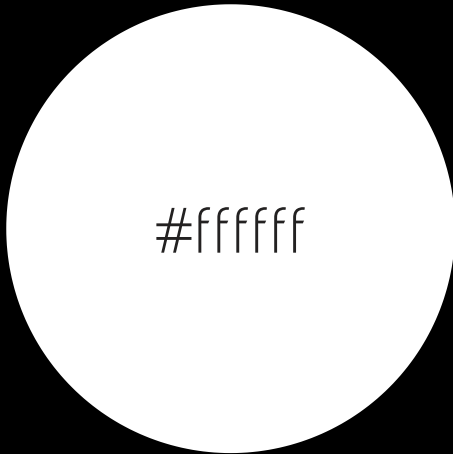
Middlebury Snow White