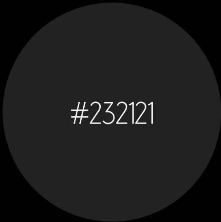
Brave New World