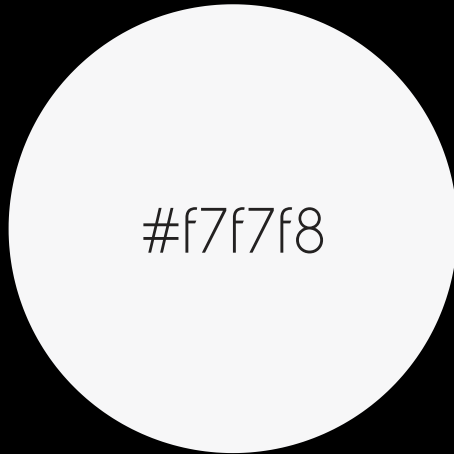
Made of Stone